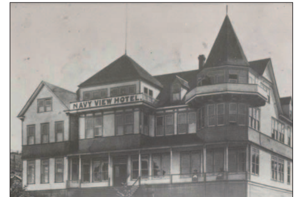
The Sidney Hotel, which later became the Navy View Hotel, around 1900.