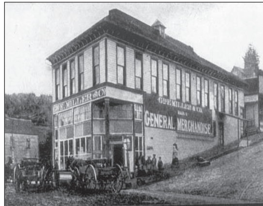
Miller General Merchandise, circa 1900.