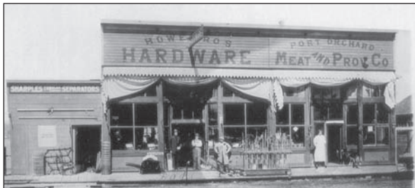
Howe Brothers Hardware and Port Orchard Meat and Provision Co., circa 1900.

The Sidney pier is still in use, with a new marina park nearby. Marine access is no longer available from Frederick and Harrison Streets.