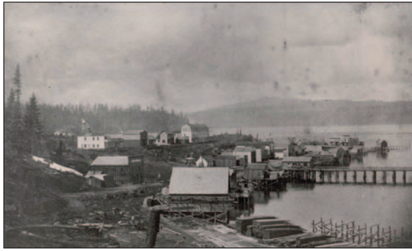
Looking westward along Bay Street, circa 1892.