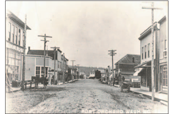
Bay Street at Sidney, circa 1908